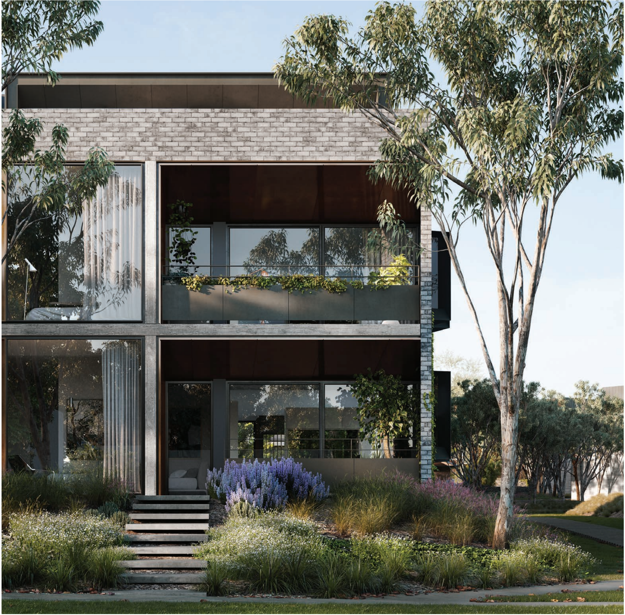
Artist Impression — Boulevard Exterior

Designed by the award-winning landscape architecture firm ASPECT Studios, the precinct is interwoven with the natural environment at every level, dedicating over half of the land area to leafy outdoor space. Communal courtyards are connected by landscaped pathways through to the central Village Green lawn.