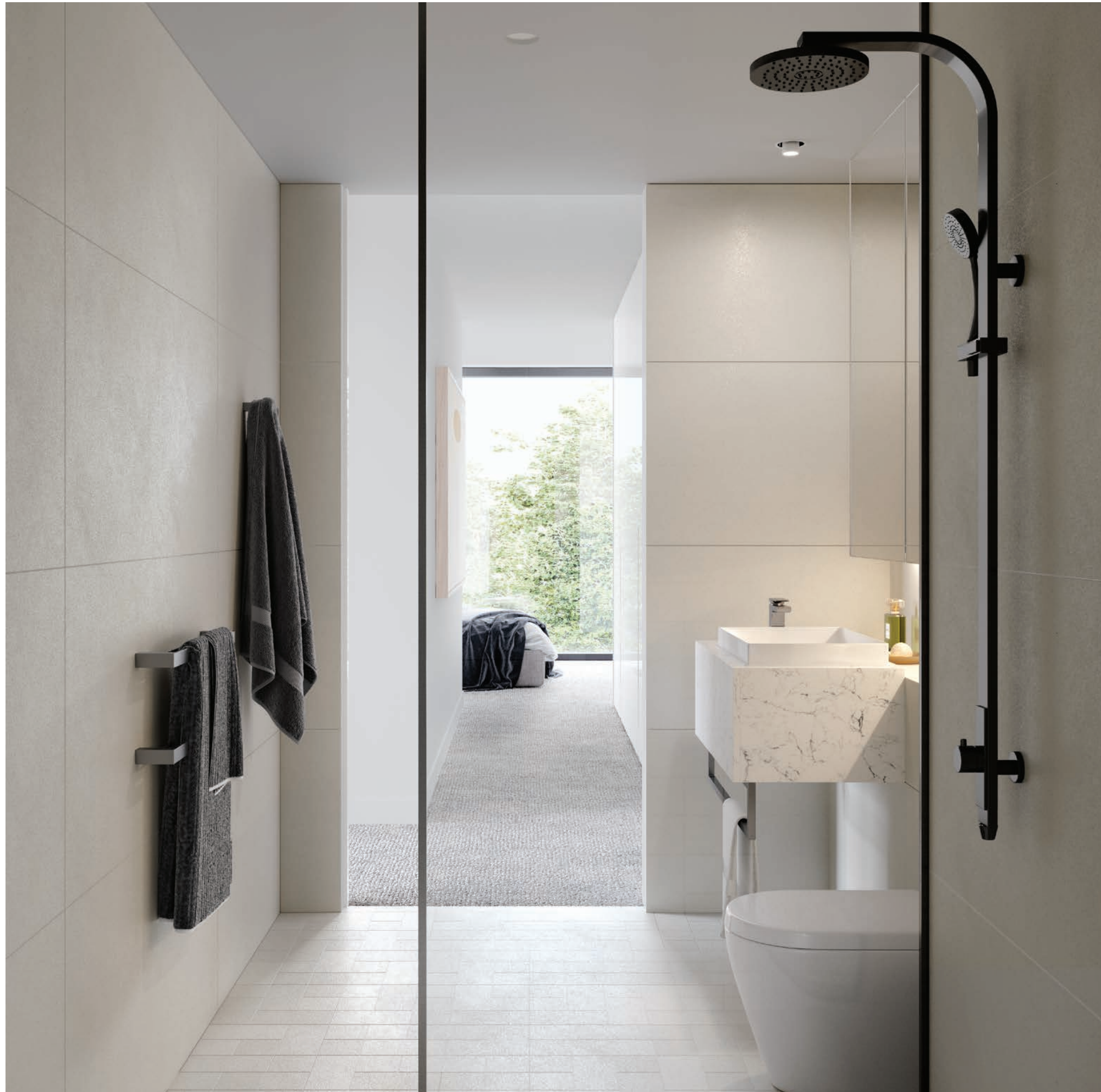
Artist Impression — Apartment Bathroom, Dawn Scheme