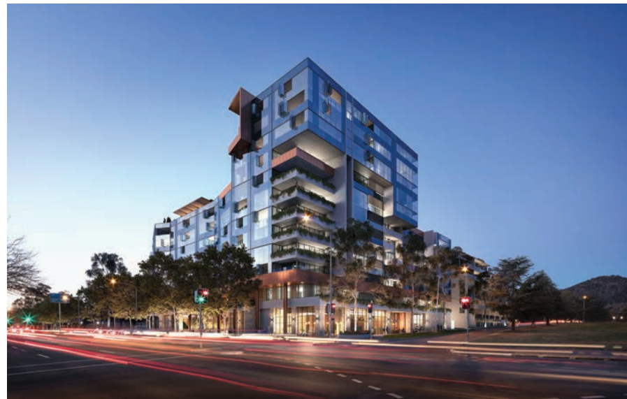
Founders Lane, ACT