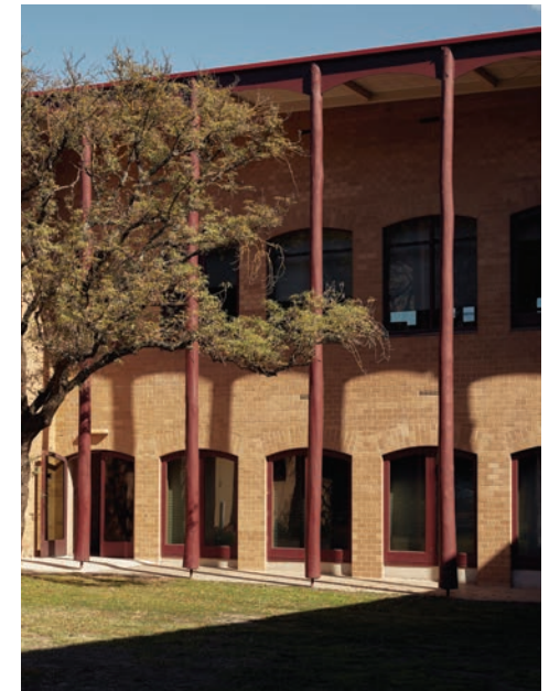
Architecture Inspiration — St George's Anglican Church