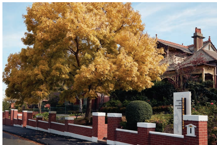
Ivanhoe Girls' Grammar School

Enjoy a delicious morning coffee at Pinkie Café, or fine Italian dining at Little Black Pig & Sons. Find everything you need close by – whether in Ivanhoe East Village, or at major hubs Ivanhoe Shopping Centre and Heidelberg Central. Experience a neighbourhood that offers a rich range of opportunities. Select from a number of prestigious schools, including Ivanhoe East Primary, Ivanhoe Grammar and Ivanhoe Girls' Grammar. Take advantage of numerous public transport connections to easily visit neighbouring suburbs such as Kew and Eaglemont.