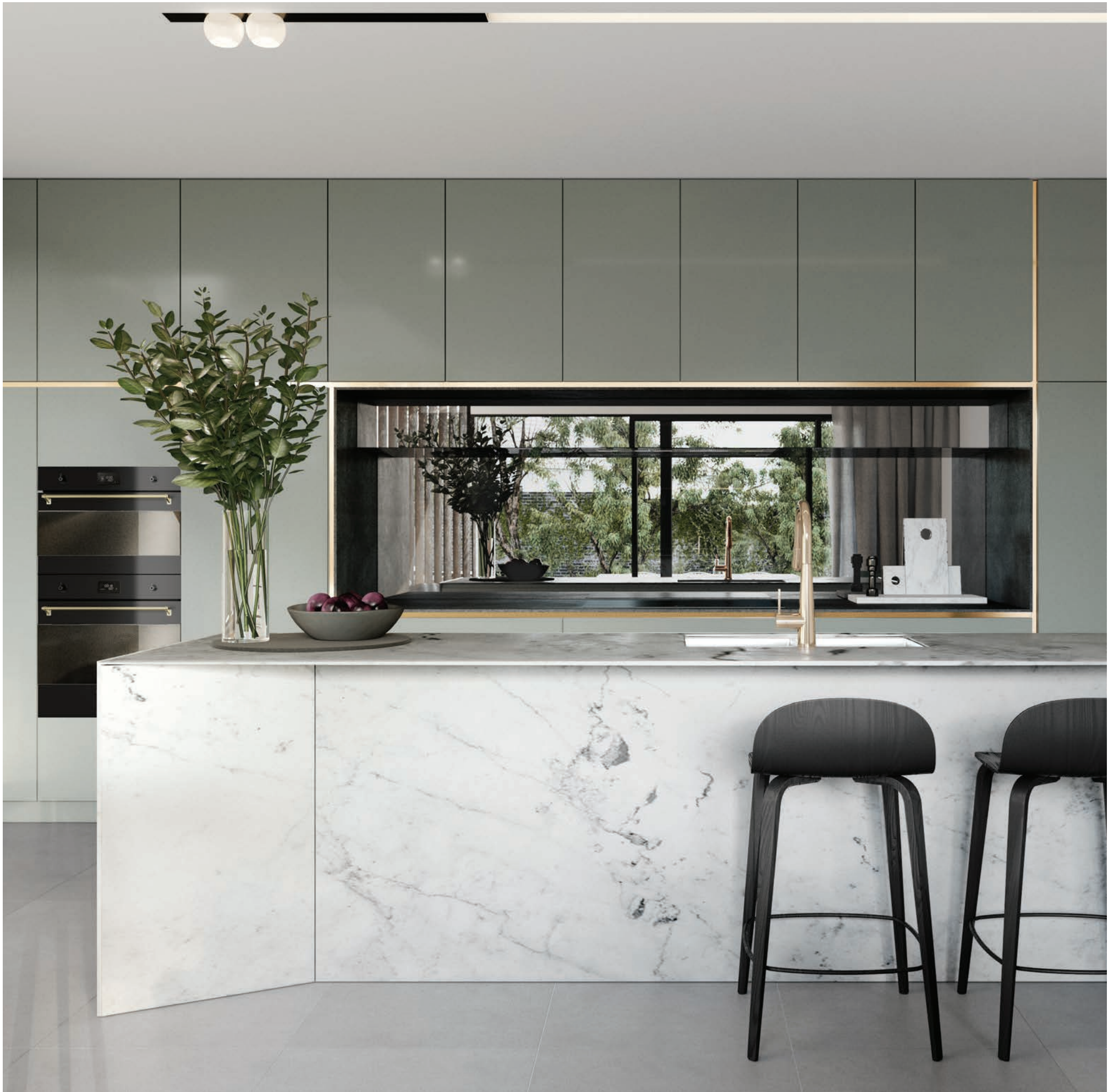
Artist Impression — Oak Terraces Kitchen, Dusk Scheme

Stunningly appointed with the natural materiality of stone, timber, warm metals, and earthy textures, each Oak Terrace home features hardwood flooring, full height joinery, and distinctive staircase designs. Balconies and courtyards seamlessly integrate daily living with the natural environment. Layouts are designed across two and three level options in a choice of colour schemes. Kitchens are a home chef's dream with European appliances, natural stone benchtops, and complemented by a larder. Master suites combine pure wool carpets with luxurious dressing rooms.