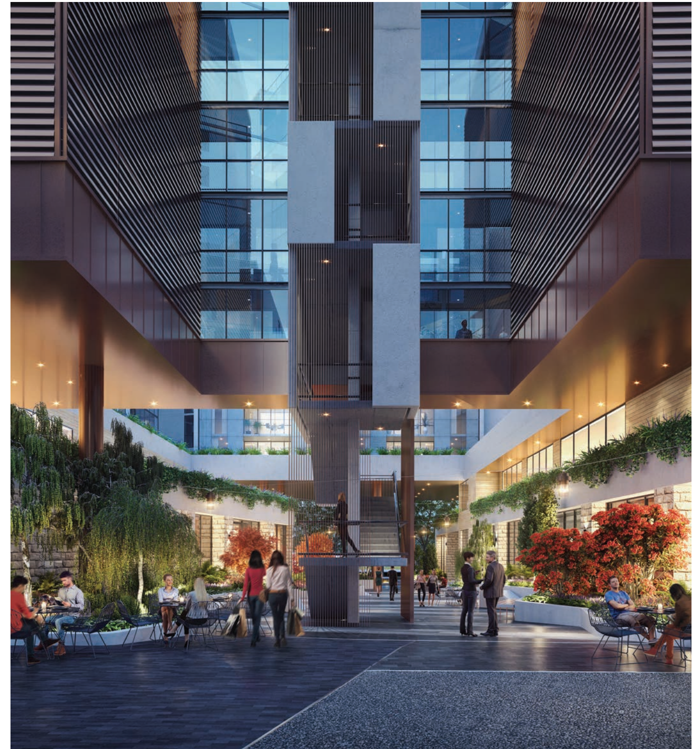
Founders Lane, ACT

JWLand is an Australian property development company. It is a significant participant in the residential property industry, particularly in Canberra, where its headquarters are located and in Melbourne. JWLand's greatest strength is the extensive experience and specialist expertise of internal teams, including in-house development, design, sales and project marketing departments.