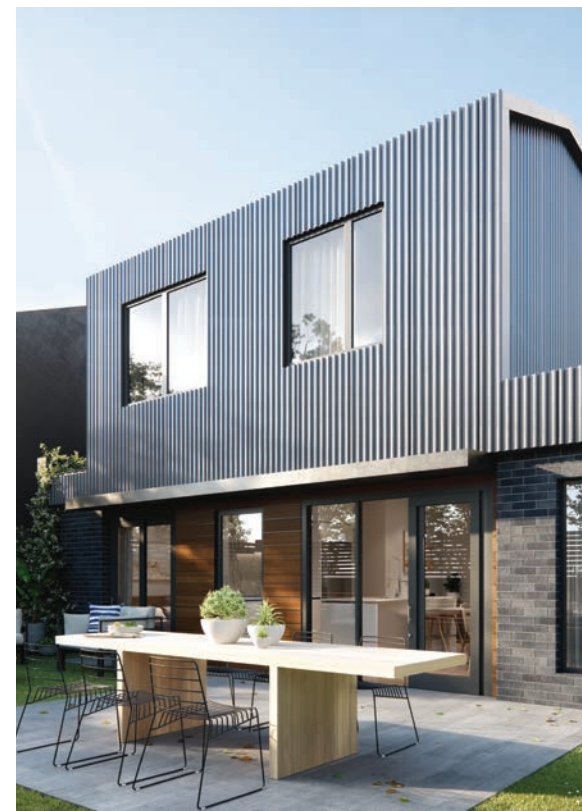
The Ridge, Watson ACT

JWLand is an Australian property development company. It is a significant participant in the residential property industry, particularly in Canberra, where its headquarters are located and in Melbourne. JWLand's greatest strength is the extensive experience and specialist expertise of internal teams, including in-house development, design, sales and project marketing departments.