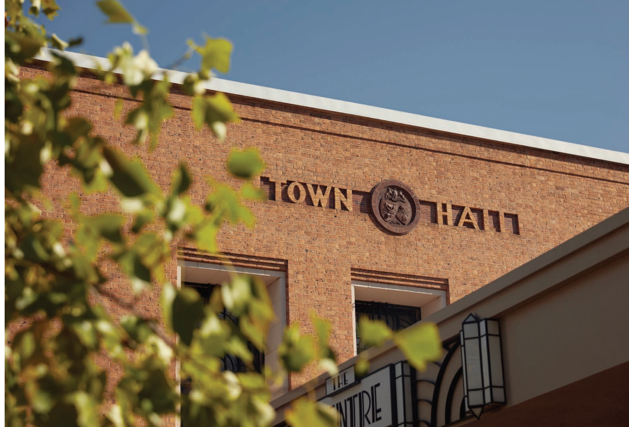
Heidelberg Town Hall