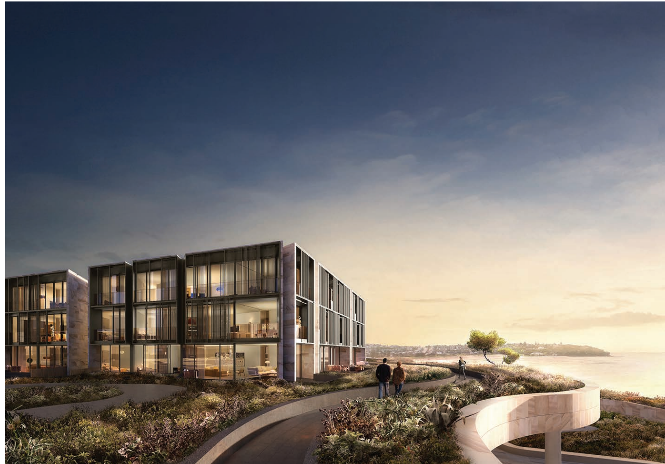
Harbord Diggers Redevelopment

Architectus is a leading design studio that brings together the experience of more than 350 architects, interior architects, urban designers and urban planners.