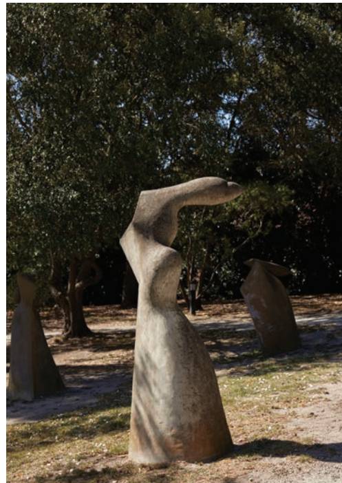
Heide Museum of Modern Art